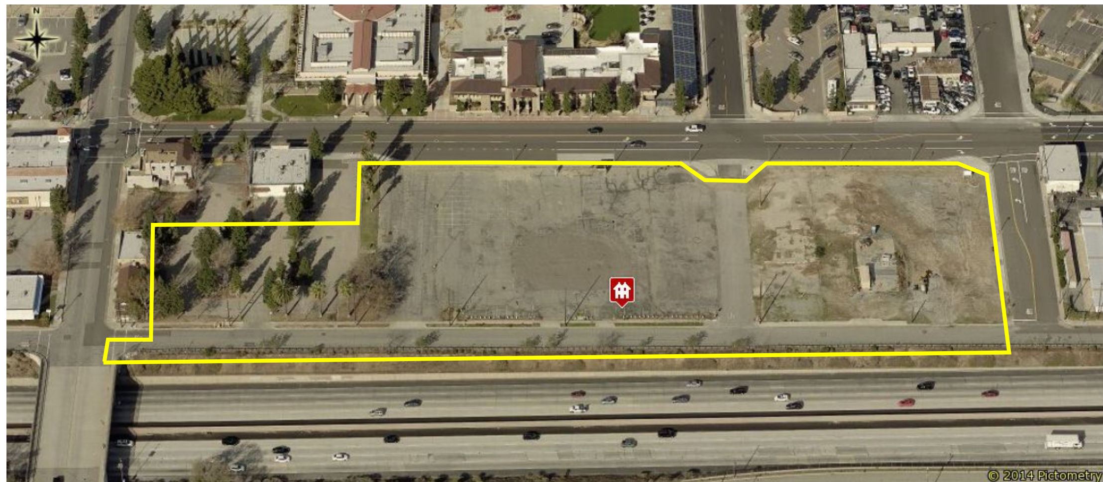
Image of APNs 541-181-032 Thru -035