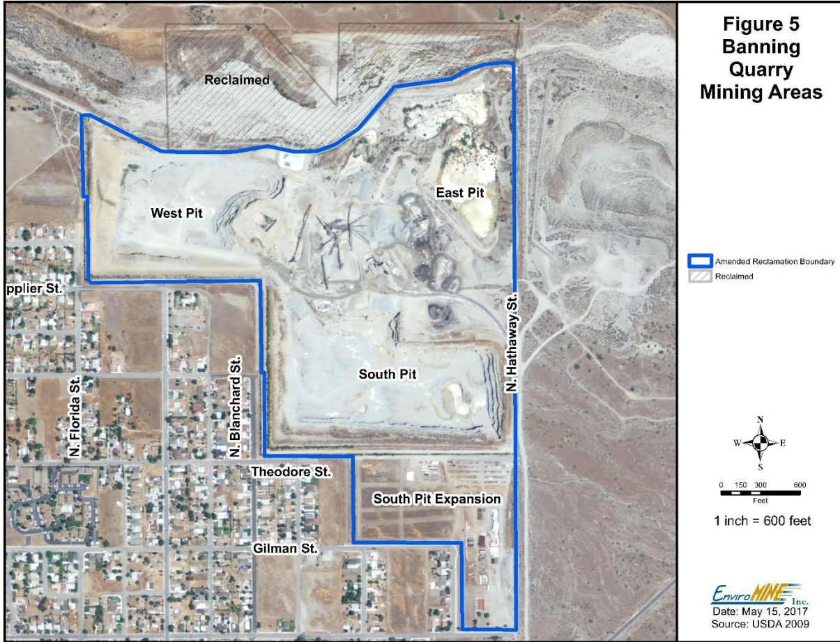
EXHIBIT C QUARRY MINING AREAS